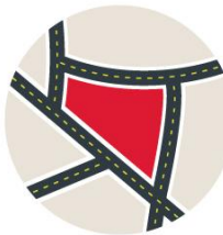
GPS & Plat Line Data