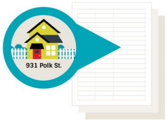
Advertisers CRM Data

Step 3: The users are served ads from the addressable geo-fencing campaign.