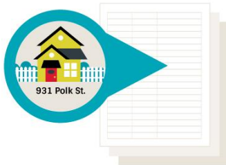
Advertisers CRM Data

Step 3: The users are served ads from the addressable geo-fencing campaign.